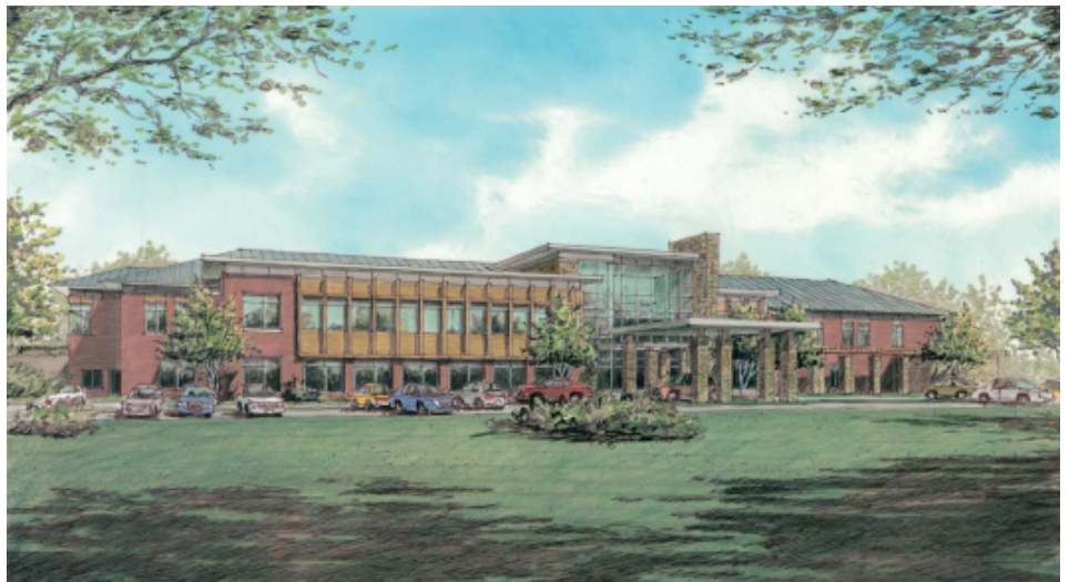
Architect's rendering of new Northeast Rehabilitation Hospital under construction at the Pease Tradeport in Portsmouth, NH.

JSA, Inc. of Portsmouth, NH is the architect for this project which will be ready for occupancy in the spring of 2011.