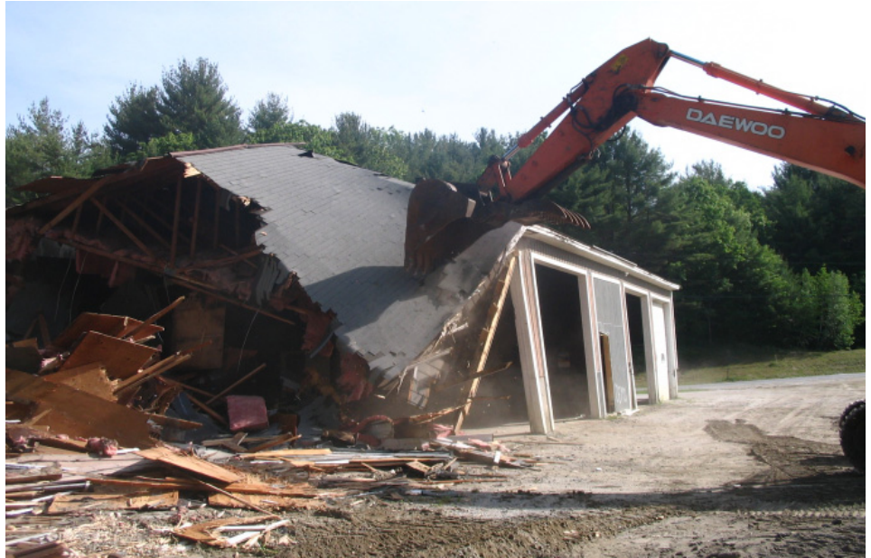
Out with the old in with the new. Above: The old Sutton DPW Building is demolished to make way for a new facility. Below: Framing is underway for the new building.

TF Moran has teamed with North Branch providing civil, structural and architectural plans. Framing for the new structure is underway and is scheduled for completion in early November.